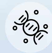
PN Premium Medical grade