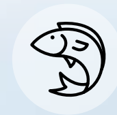
Alaskan Salmon DNA

It activates fibroblasts to significantly boost the production of collagen and elastin, which are essential for maintaining skin firmness, elasticity, and structural integrity.