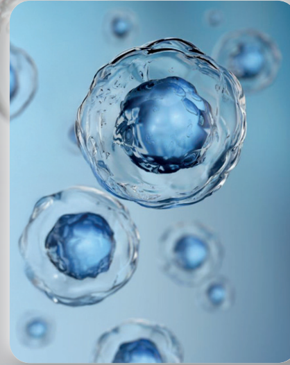
[ PDRN ]

Vitamin B12 gives lips a temporary red hue, enhancing their appearance.