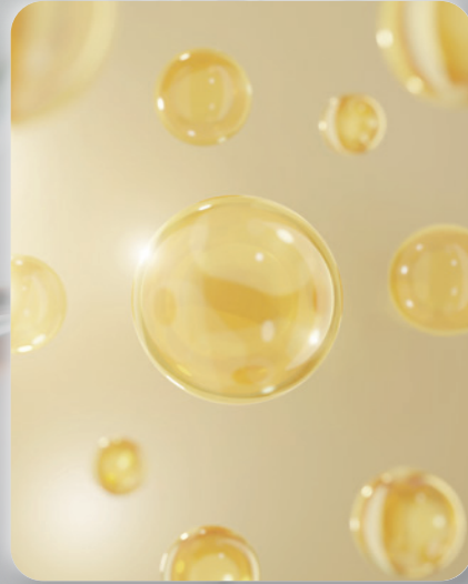
[ Vitamin B12 ]

HA attracts and retains moisture, keeping skin hydrated and plump.