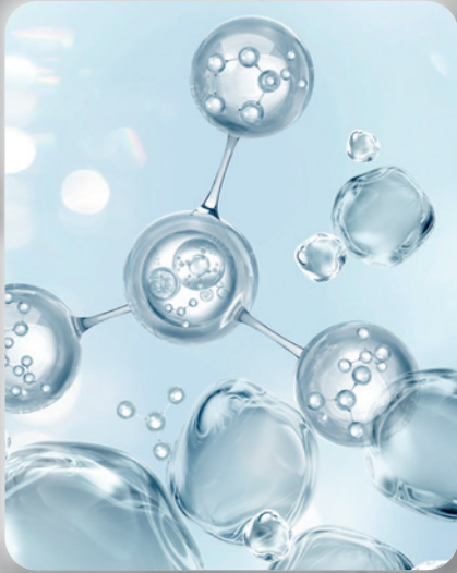
[ Hyaluronic Acid ]

HA attracts and retains moisture, keeping skin hydrated and plump.